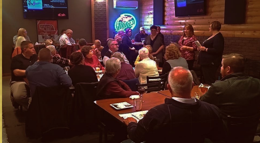
All the volunteers were given gift bags with goodies in them along with a certificate of service.