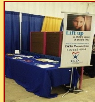
The CASA Connection staff enjoyed spreading awareness of the organization during the Colfax County Fair in Leigh.

Our Board of Directors had their annual meeting during which the new officers were appointed. We appreciate our officers donating their time & talents to CASA.